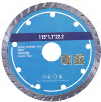
Turbo Blade Dry