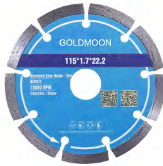
Segment Blade Dry