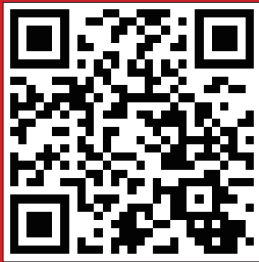
Company Web Behappy