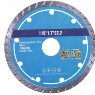
Continuous Blade Wet